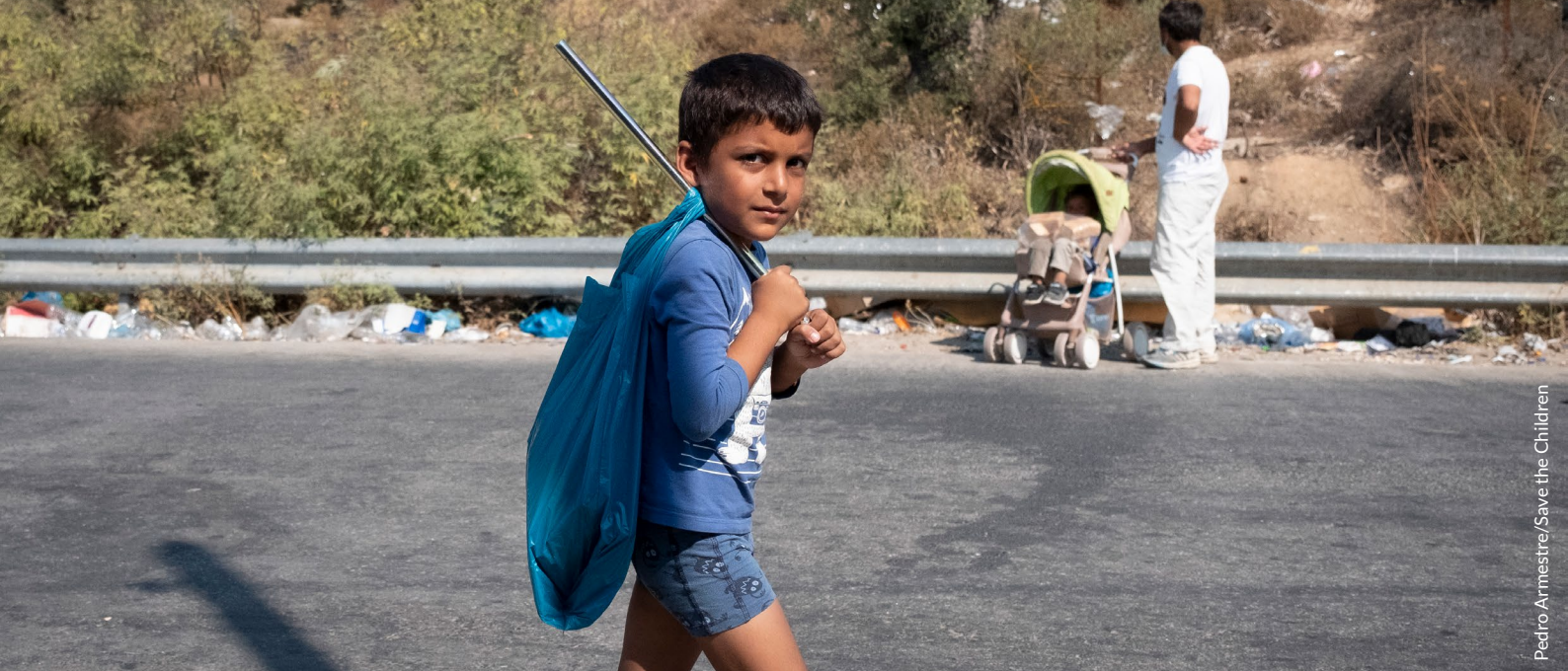
Pedro Armestre/Save the Children

Movement of refugee and migrant children who arrive in Ceuta and Melilla, two enclaves of Spanish territory on the African continent, is also heavily restricted. Regulations applied by the authorities mean asylum applicants must wait for the decision regarding the admissibility of their claim before they can go to the Spanish peninsula and its asylum reception system, and they must also acquire an authorisation by the National Police. These limitations to the right to freedom of movement across Spanish territory have repeatedly been declared unlawful by Spanish courts but remain in practice.